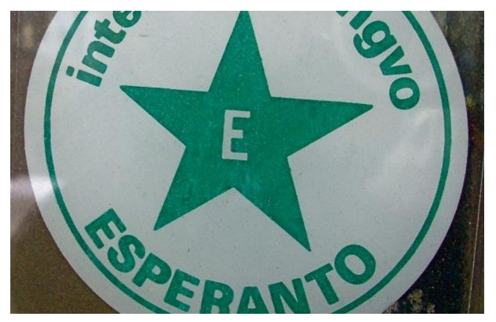
The Psychology of Natural Versus Constructed Languages