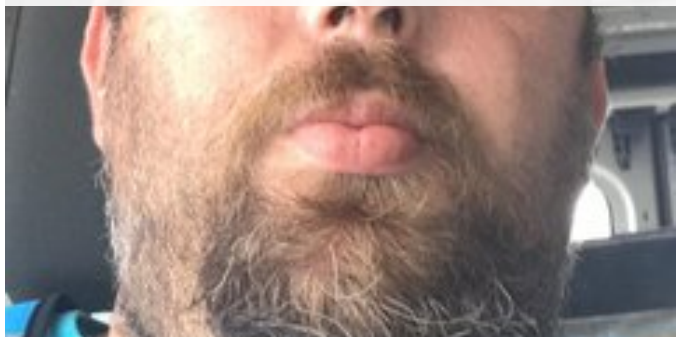
Amazon Worker Who Died In Warehouse Sent This Eye-Opening Text NYPost.com