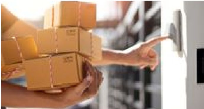
Best monthly subscription boxes 2021: 24 fun, unique options for... New York Post