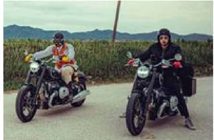
Stream It Or Skip It: 'The Hungry And The Hairy' On Netflix, A... Decider