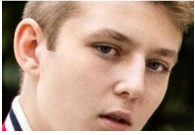
The Truth About Donald Trump's Youngest Son Is No Secret Anymore TheList.com