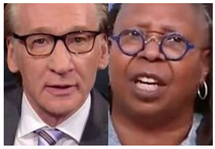
Maher Savagely Fires Back At Goldberg As Beef Takes A Big Turn Decider.com